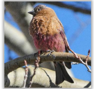
Brown-capped Rosy-Finch at Crested Butte

DAY 8 (April 8) Early morning in Black Canyon of the Gunnison National Park for Dusky Grouse then Crested Butte for rosy-finches With an early morning visit to the fantastic Black Canyon of the Gunnison National Park we'll hope to find displaying Dusky Grouse. Following breakfast, we'll visit Crested Butte in search of all three rosy-finches (Black, Gray-crowned, Brown-capped). Time permitting we'll make a late afternoon inspection of the Gunnison Sage-Grouse lek. Drive time from Grand Junction to Gunnison: ~2.5 hours. Night #8 in Gunnison CO.