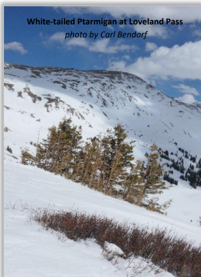
White-tailed Ptarmigan at Loveland Pass

DAY 9 (April 9) Early morning Gunnison Sage-Grouse lek, the east over Monarch Pass to Salida, Colorado Another early morning lek visit – this time for the highly range-restricted Gunnison Sage-Grouse . This may be our most challenging chicken of the tour, as the lek is a long distance from the blind and does not provide high-quality viewing. NOTE: there is a remote possibility that we won't be able to see this bird as birds are not seen every day and the viewing blind is sometimes closed completely by game management officials to reduce stress on the birds. After breakfast, we may look again for rosy-finches if necessary and then bird our way east over Monarch Pass (11,312 feet) where we'll seek out Williamson's Sapsucker and American Three-toed Woodpecker. Drive time from Gunnison to Salida: ~1.5 hours. Night #9 in Salida CO.