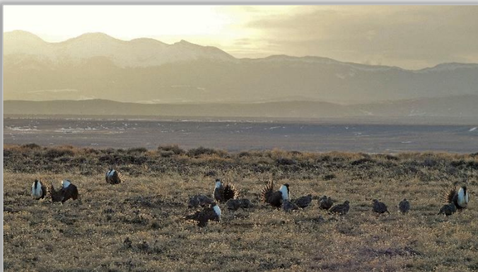
Greater Sage-Grouse at lek

DAY 5 (April 5) Colorado's Front Range foothills, then up and over Cameron Pass to North Park A later start this morning will allow for a welcome sleep-in. Once on the road, we'll bird the Front Range foothills, then up and over scenic Cameron Pass (10,249 feet). En route we may encounter moose, as well as great birds such as Clark's Nutcracker, Red-naped Sapsucker, and our first shot at rosy-finches. After checking into the historic Chedsey Motel, we'll relax before dinner in downtown Walden. Join us for an optional drive back up near Cameron Pass in search of Boreal Owl or stay back at the Chedsey and turn in early. Drive time from Longmont to Walden: ~3 hours. Night #5 in Walden CO.