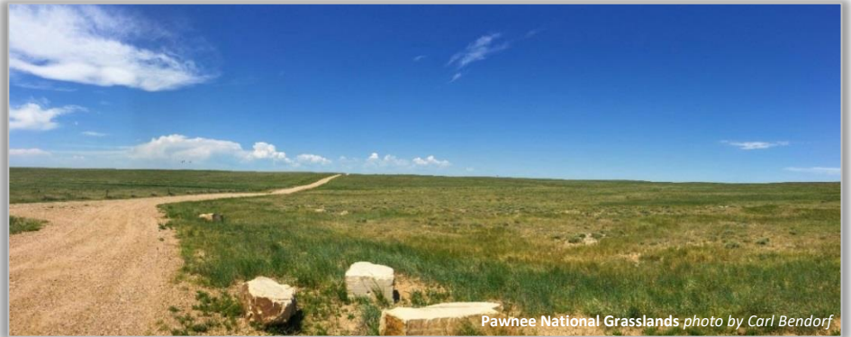
Pawnee National Grasslands

DAY 4 (April 4) Early morning Greater Prairie-Chicken lek, then west to Pawnee National Grasslands Another early morning check out and our second lek of the tour, this time for Greater Prairie-Chicken . Following breakfast, we'll head west to the famed Pawnee National Grasslands, where we hope to find Mountain Plover and both Thick-billed and Chestnut-collared longspurs. Pawnee is also an excellent spot for Burrowing Owl and Lark Bunting. From Pawnee we'll explore some water areas where we'll look for both Western and Clark's grebes, American Avocet, Black-necked Stilt, and Wilson's Phalarope on our way to our hotel in Longmont. Drive time from Wray to Longmont: ~3 hours. Night #4 in Longmont CO.