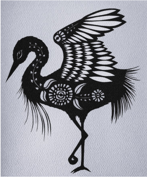
Cut paper art "The Heron", by Angie Pickman