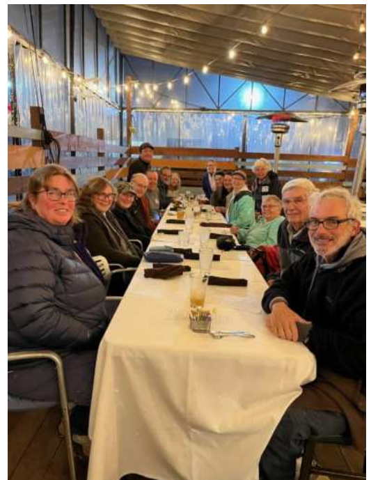
Plate 38 – January 20, dinner

Trader Joe's (lunch on Santa Cruz Island) – January 20, lunch