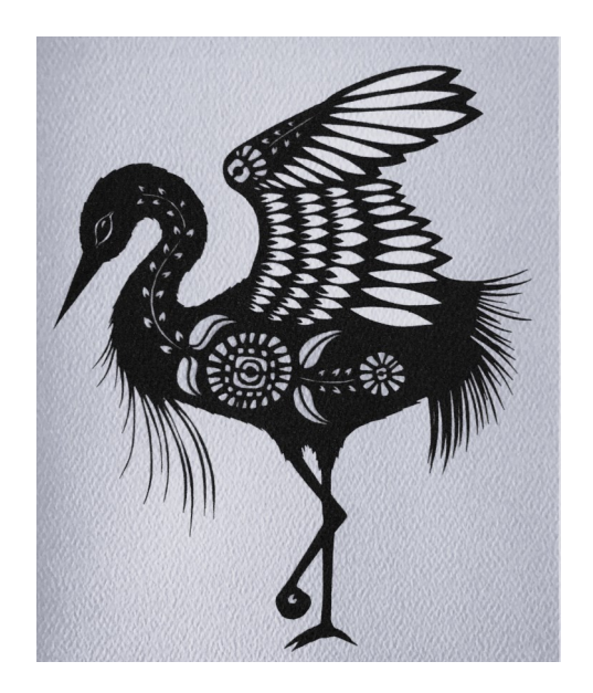
Cut paper art "The Heron", by Angie Pickman