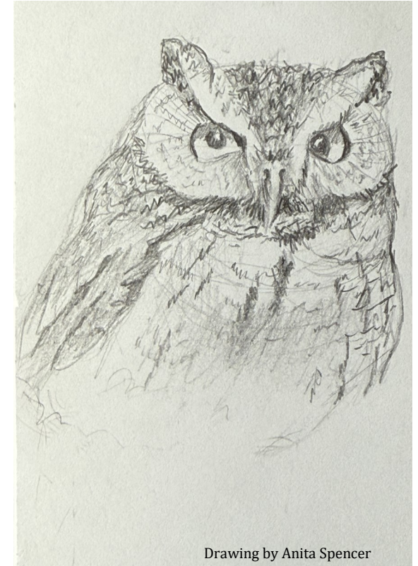
Drawing by Anita Spencer